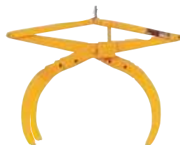
Pantograph tongs for gripping round goods 125 kg