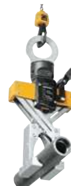
Load hook adapter with connected PGS shaft gripper