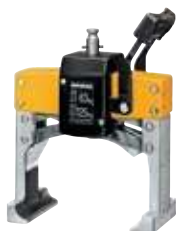
PGS-parallel gripper 125 kg

1) 2m+ corresponds to 1900 hours at full load