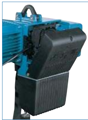
Pivoting service cover